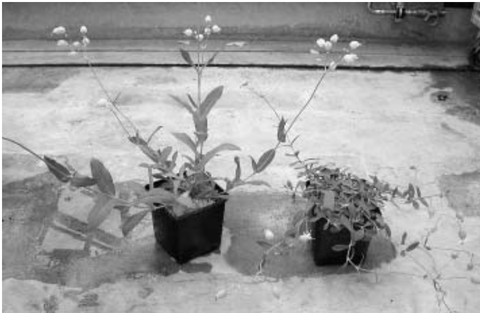
Fig. 1. Morphological differences between plants of Silene vulgaris cultivated in the greenhouse from seeds collected in a meadow population on fertile soil with normal heavy-metal content (left) and in a serpentine population on 'Totalp' near Davos-Wolfgang (right).

Naturally heavy-metal contaminated sites, such as serpentine soils (ultramaphic rocks) are found throughout the world (Ernst 1974)