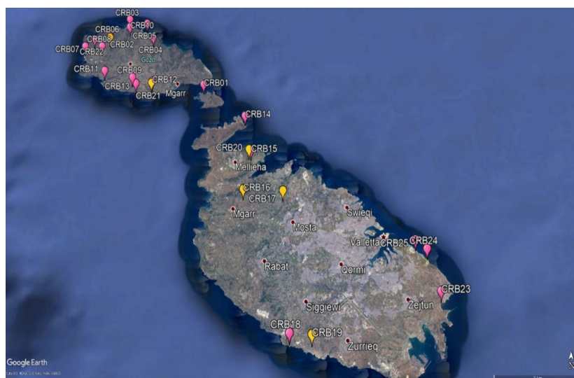
Figure 1. Map of the Maltese Islands showing the location of the studied populations of C. edulis (yellow mark), and C. acinaciformis s.l. (purple mark).

Herbarium specimens are bulky and unsuitable for the study of Carpobrotus (destructive analysis, colour not restored, the requirement of analyzing more than one organ or sample, etc. (Preston & Sell, 1988). Therefore, a representative photo was instead taken for