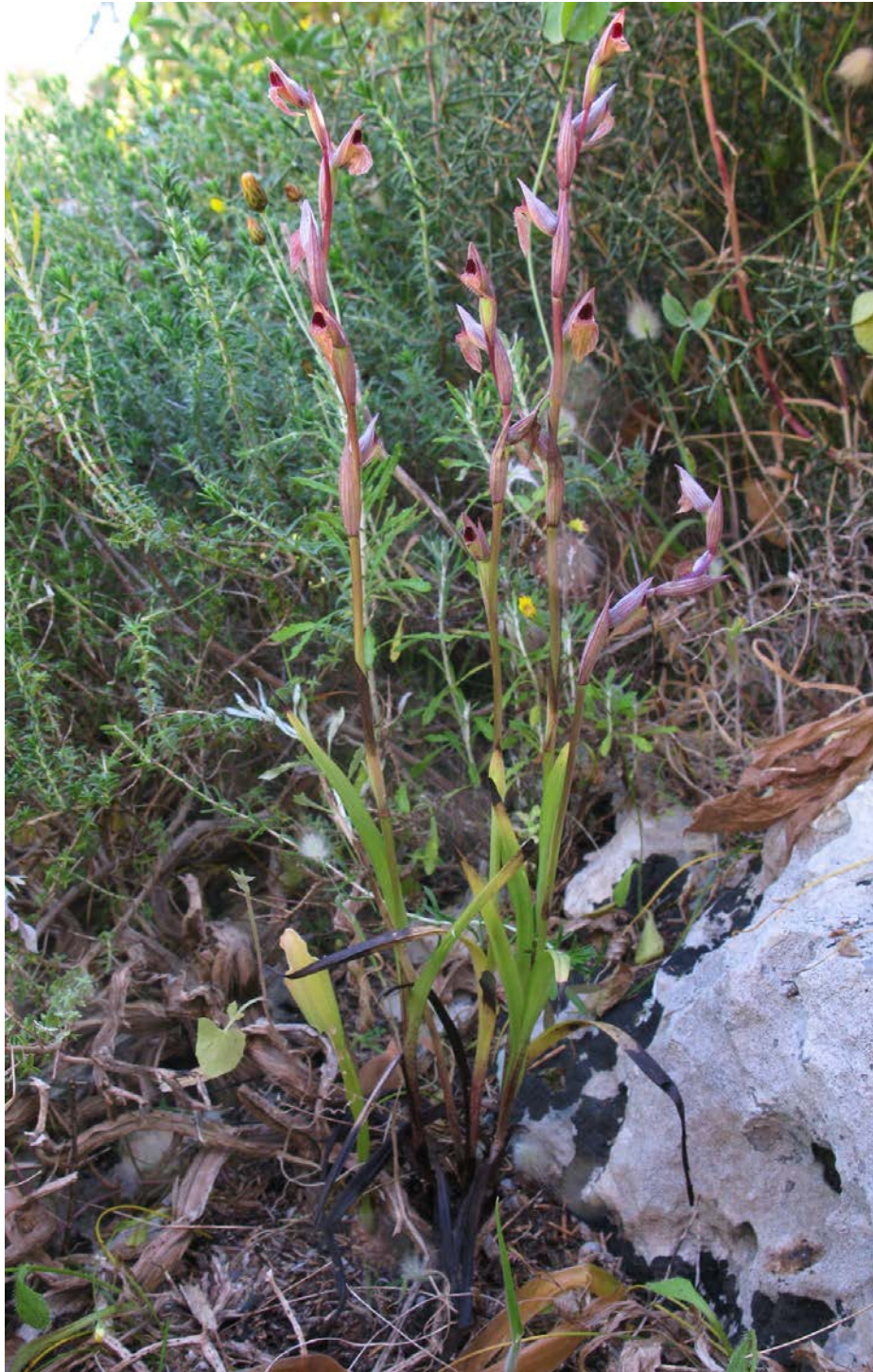
Figure 1: New population of Serapias bergonii at Wied tax-Xlendi, Xlendi, Gozo. (19-Apr-2010)