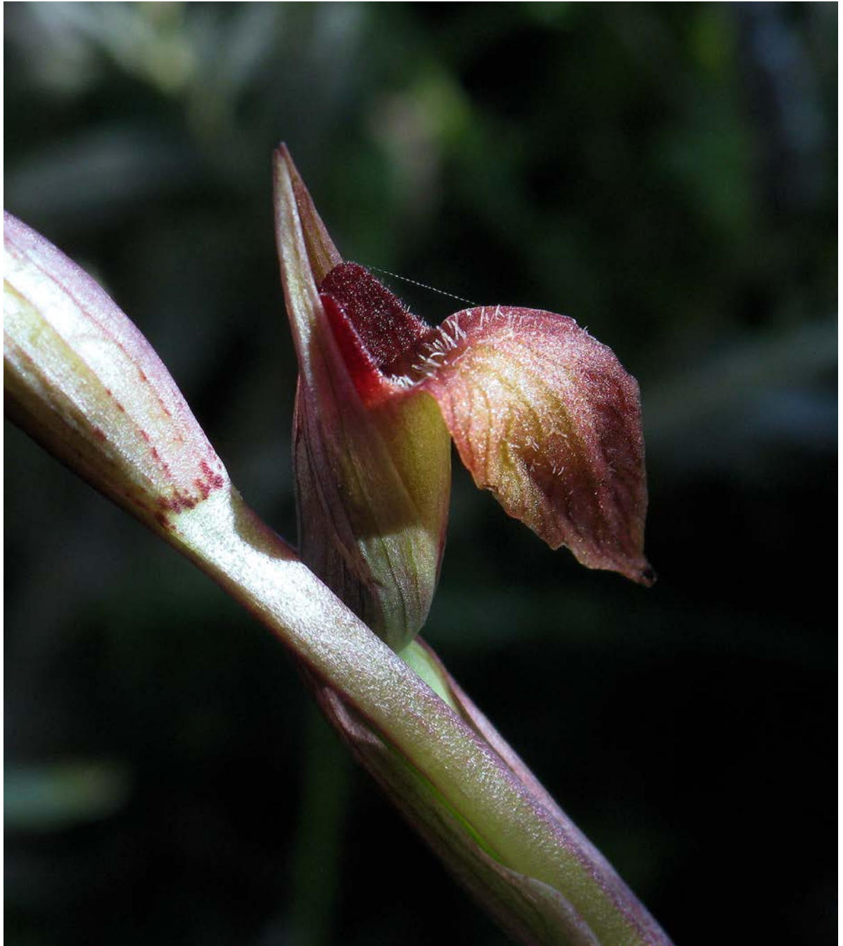
Figure 2: Close up of flower of Serapias bergonii in situ at Wied tax-Xlendi, Xlendi, Gozo. (19-Apr-2010)