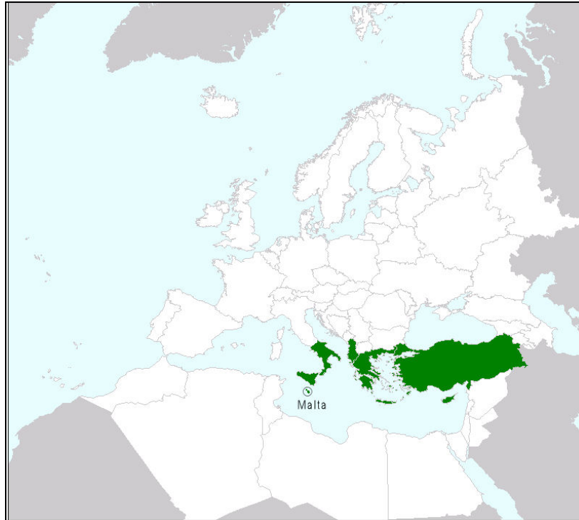
Figure 3: Distribution of Serapias bergonii in Europe, restricted to the Eastern Mediterranean region. Adapted from EMP (2010). Shaded area for Italy is adapted from the regional occurrences given by Conti et al (2005).